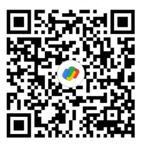
FOR NON GST USERS OR CODE UPI ID .: jignesh.malaviya-2@okaxis

FOR NON GST USERS OR CODE Pay With Google Pay